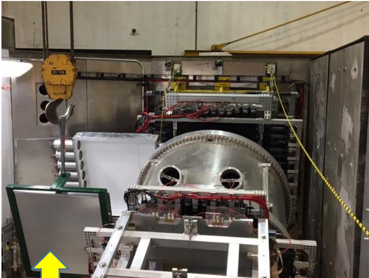
SP-11 aerogel tray installation